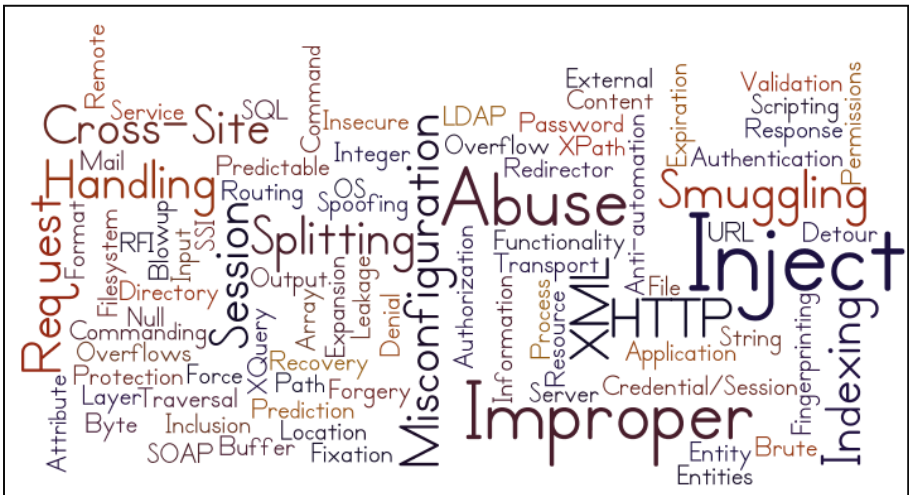
Figure 3. Tag cloud of the web application security consortium threat classification

Figure 3 is WASC threat classification in a tag cloud format. HiSPO approach uses the same principle to calculate the weight for each threat [18].