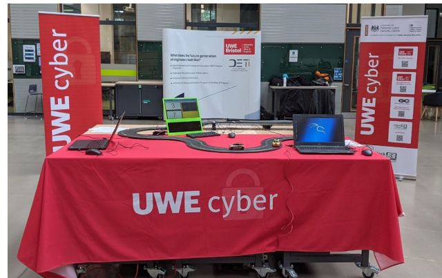
Fig. 1. Scalextric slot-car racing challenge where students can hack the scoreboard to reset the opponents score and artificially increment their own

Our objective was to provide an exciting and immersive experience for students, that would both capture their attention to draw them in, whilst learning fundamental concepts of cyber security and relating these to real-world scenarios. As a result, our team developed a cyber security challenge, integrated with a Scalextric slot-car racing set (Fig. 1), where two teams compete to achieve the highest possible score, which ultimately could be achieved by compromising the scoreboard system, either to inflate their own score or to sabotage their opponent. The challenge was designed to guide students through the cyber kill chain model, starting with basic reconnaissance and moving through to exploitation, privilege escalation, and actions on objective. The environment was configured with multiple vulnerabilities ranging in complexity, allowing for deeper exploration by more experienced students, whilst also being accessible for those less experienced.